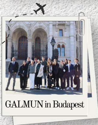
GALMUN in Budapest