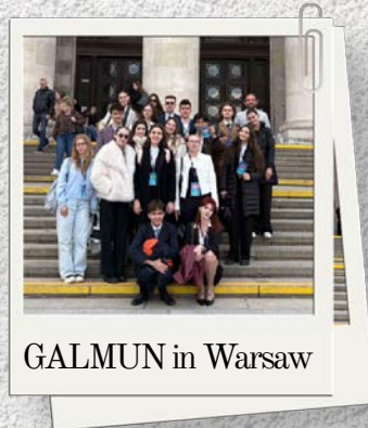
GALMUN in Warsaw