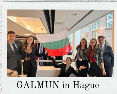
GALMUN in Hague